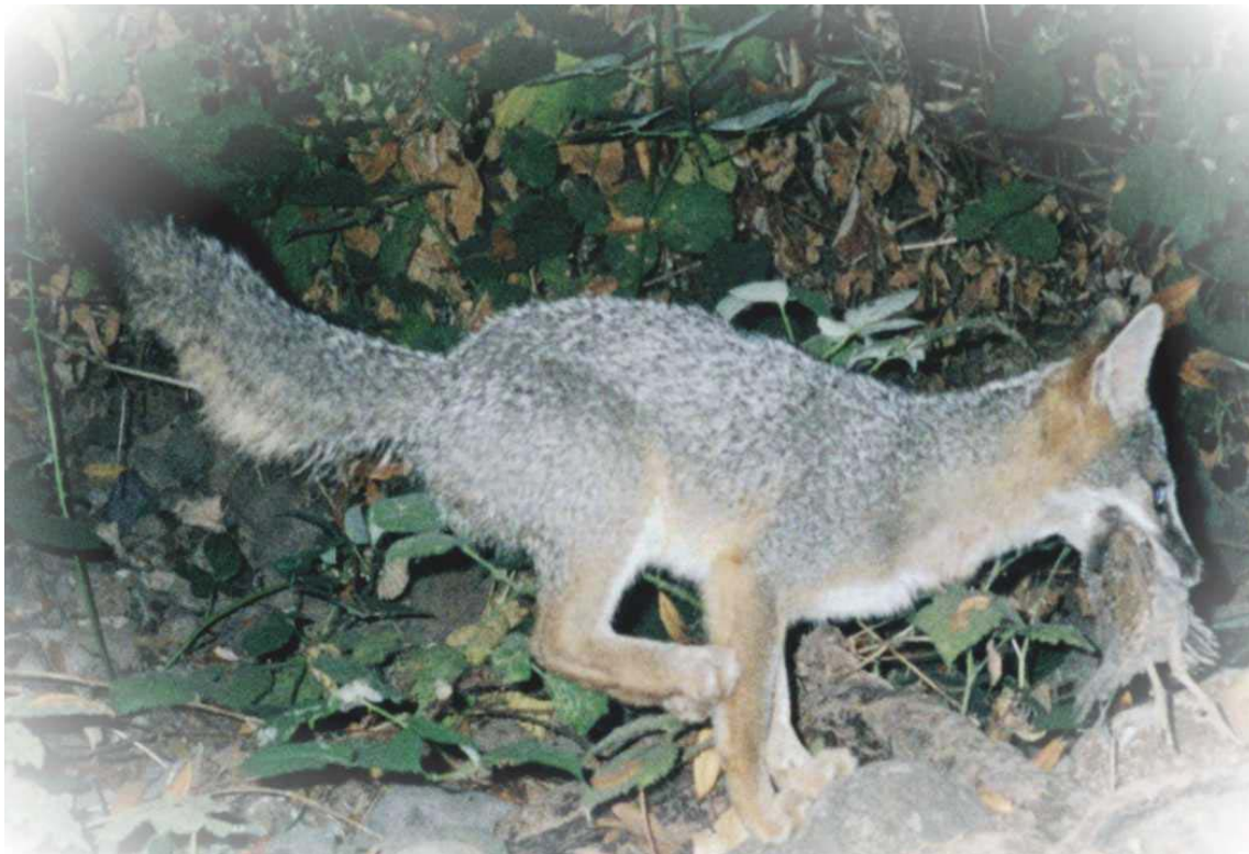
Figure 2. A grey fox ( Urocyon cinereoargenteus ) with prey taken by a remotely triggered camera along a riparian corridor in Sonoma County, California.